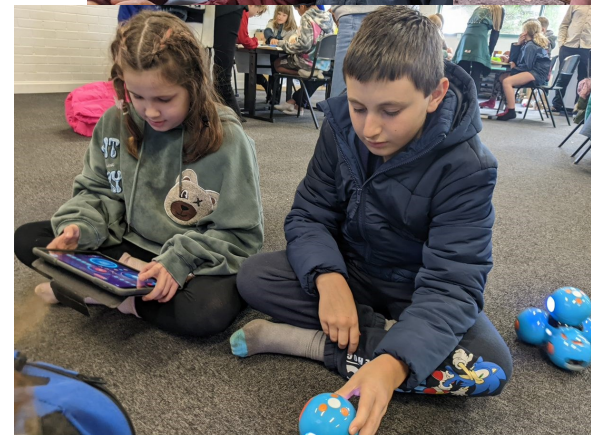
we best an wall onto had

These are the activates that we did inside camp; pedal carts, number hunt, archery, flying fox and giant swing. - Margot