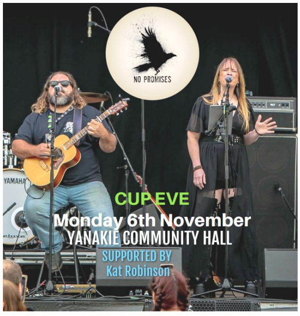
Yanakie Community Hall - Millar Rd Yanakie - Doors open 7pm

As a Sun Smart school I would just like to remind everyone that wide brimmed school hats are compulsory to wear during term 1 and term 4 of the school year. If you need a new hat please contact us at the office and we will be happy to arrange it.