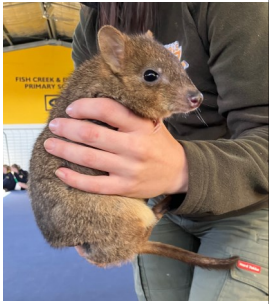
Brush tailed bettong

To help these animals survive, we can leave big old trees standing, build nest boxes to replace lost tree hollows, plant trees and keep our cats inside at night.