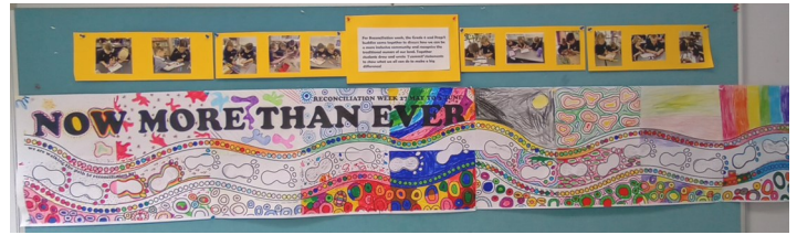
Students working together on the Now More Than Ever banner.