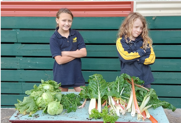
Check out our produce!!!