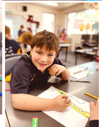
One of the many Reconciliation activities students enjoyed over Reconciliation Week.